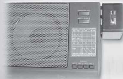
....on the side

The ANEM is easy to set up using the 3.5mm mono plug lead provided. For ease of use the modules functions are controlled by a microprocessor, enabling simple operation via two pushbuttons: power on/off audio bypass and DSP filter on/off. There are 4 or 8 levels of noise cancellation, selected via the pushbuttons on power up, and the last selected filter level remains in the memory if the power is removed. The ANEM also has a headphone/speaker switch to enable the unit to be easily used with an extension speaker or a pair of mono headphones. The ANEM comes boxed with a Fused DC power lead (2.1mm) and a 3.5mm mono plug lead 1.2m long, plus full operating and set up instructions. Audio adapters are available to suit different connections. Velcro strips are provided for mounting the module in a suitable position on your extension speaker or radio equipment.