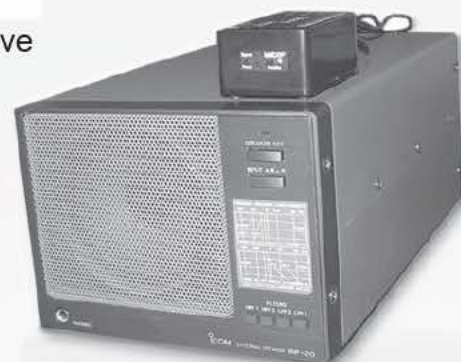
....on the top