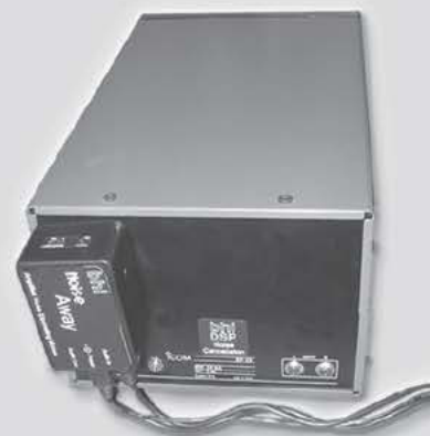
Fit it on the rear...

The module simply fits in-line between the communications equipment and the loudspeaker. The ANEM is suitable for a variety of applications but is particularly useful for improving voice quality in amateur radio, removing unwanted QRM and QRN to give much improved readability and speech intelligibility across all bands. You can listen more clearly on SSB, UHF, VHF, HF and FM.