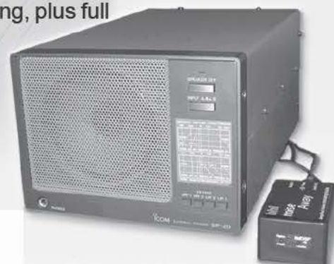
....on the desk