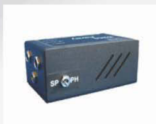
SP/PH switch above