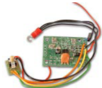
NEDSP1061-KBD version Single button control

PO Box 318, Burgess Hill West Sussex, RH15 9NR Tel: +44 (0)845 217 9926 Fax: +44 (0) 845 217 9936 sales@bhi-ltd.co.uk www.bhi-ltd.co.uk