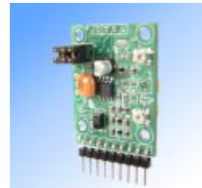
Plug - in Vertical