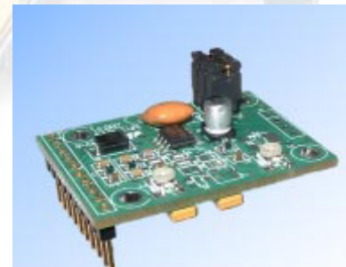
Plug - in Horizontal