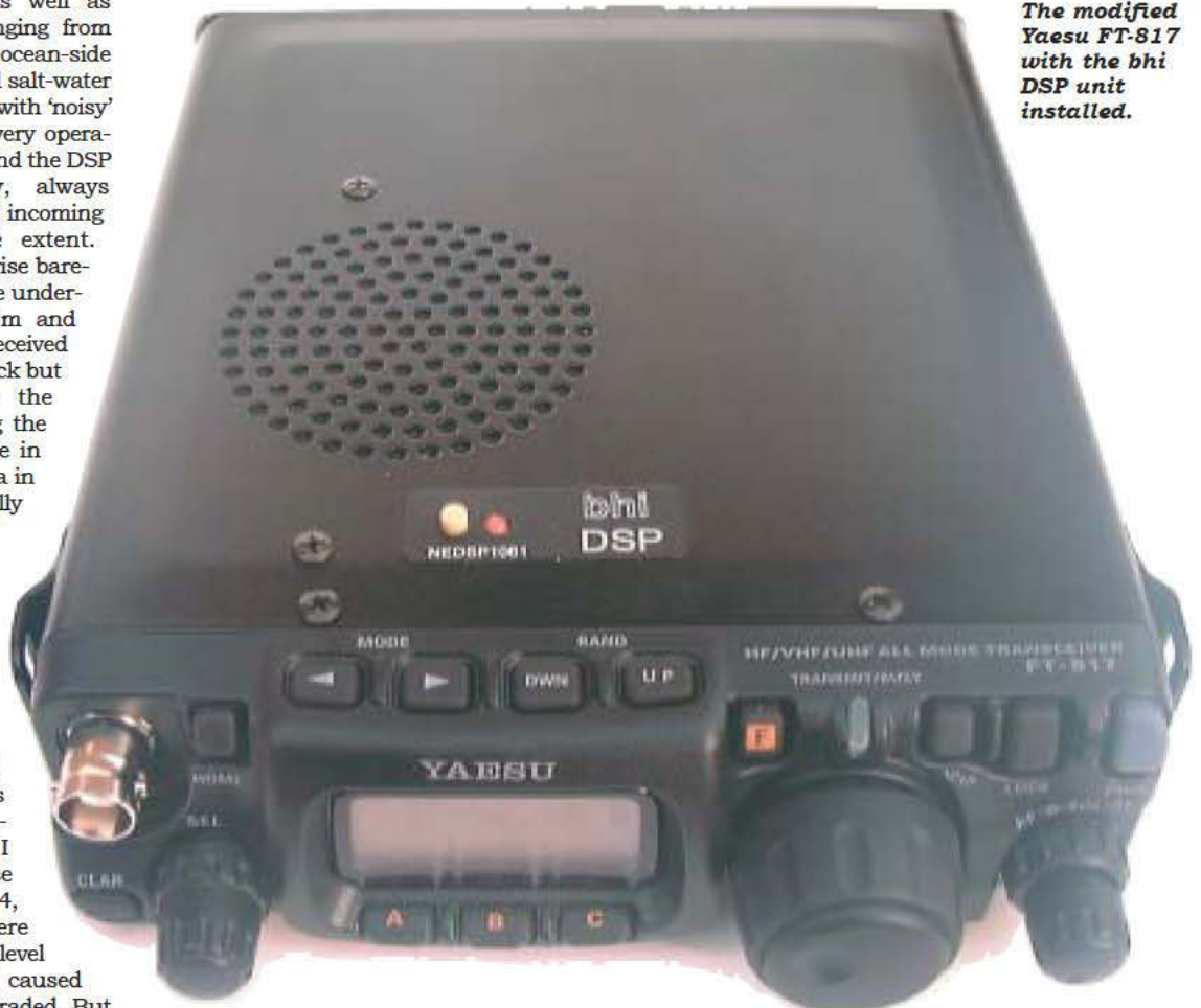
The modified Yaesu FT-817 with the bhi DSP unit installed.